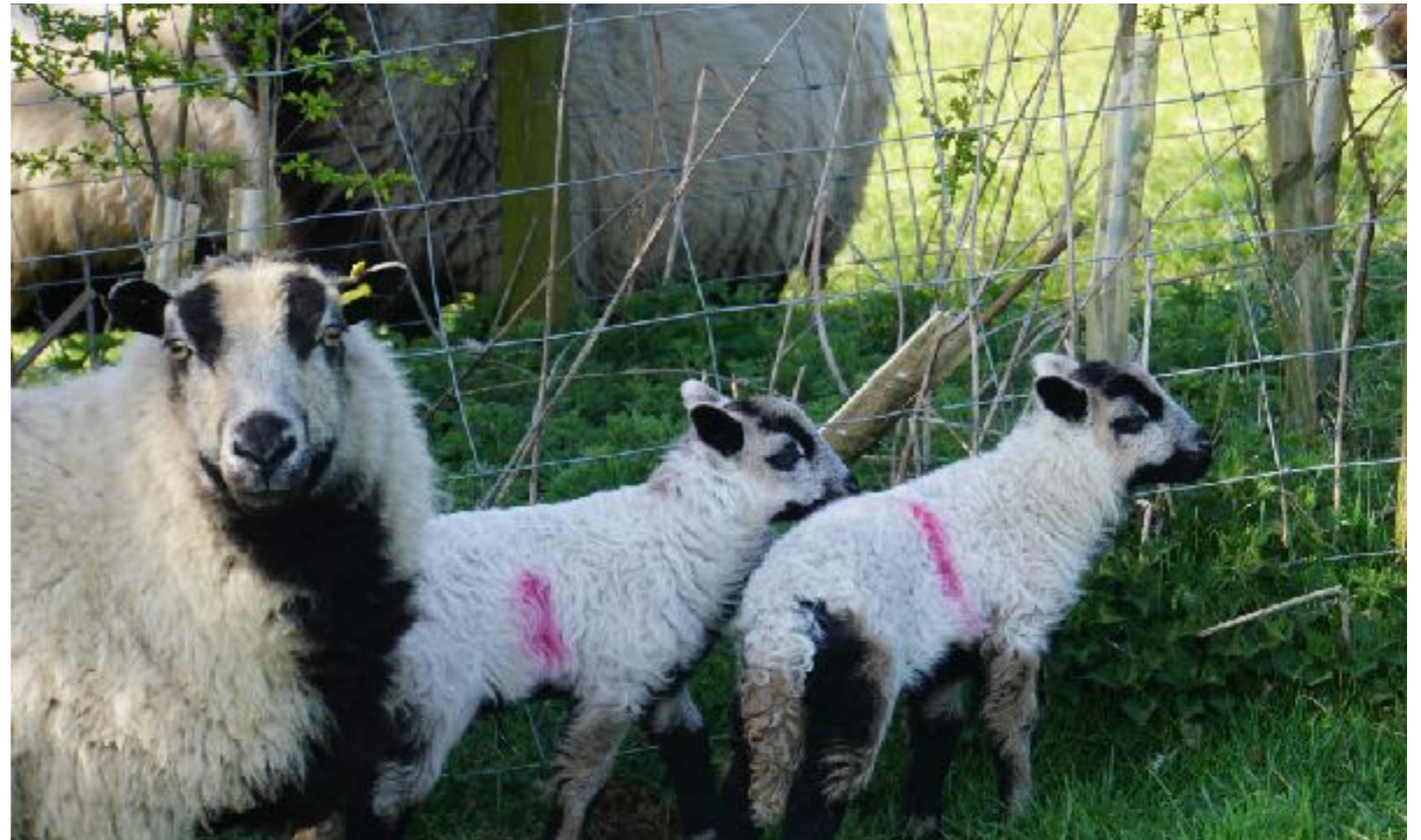
Lambing season at Reilth Top, Bishop's Moat.

herbicides and anti-biotics than the UK, with many varieties that have historically been banned in the UK and EU, some using GMOS.