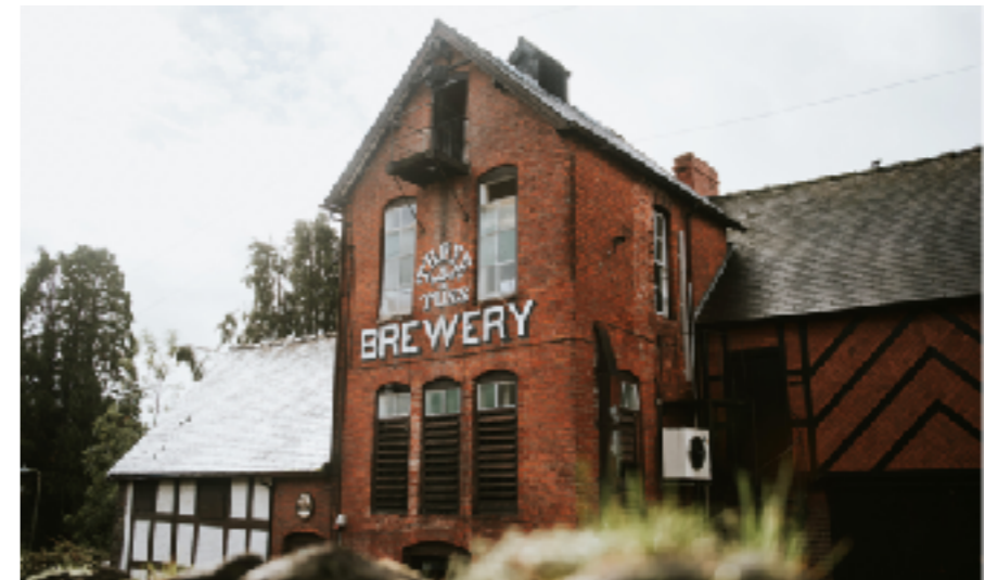
The Three Tuns Brewery.

efficiency of industrial production, but the trade-offs have made significant impacts on our environment, our health, our local economies and our connection to how food is produced. The changing climate brings real fears for humanity and the biological stability of the planet.