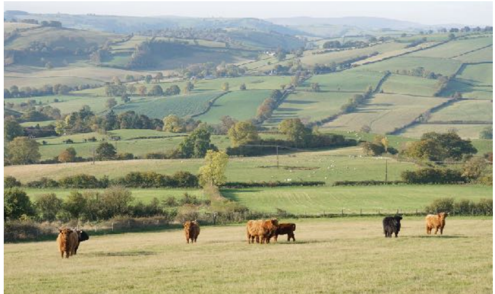
Grass-fed Highland Cattle at Reilth Top, Bishop's Moat.

The town has a number of fruit and vegetable growing sites: these include the